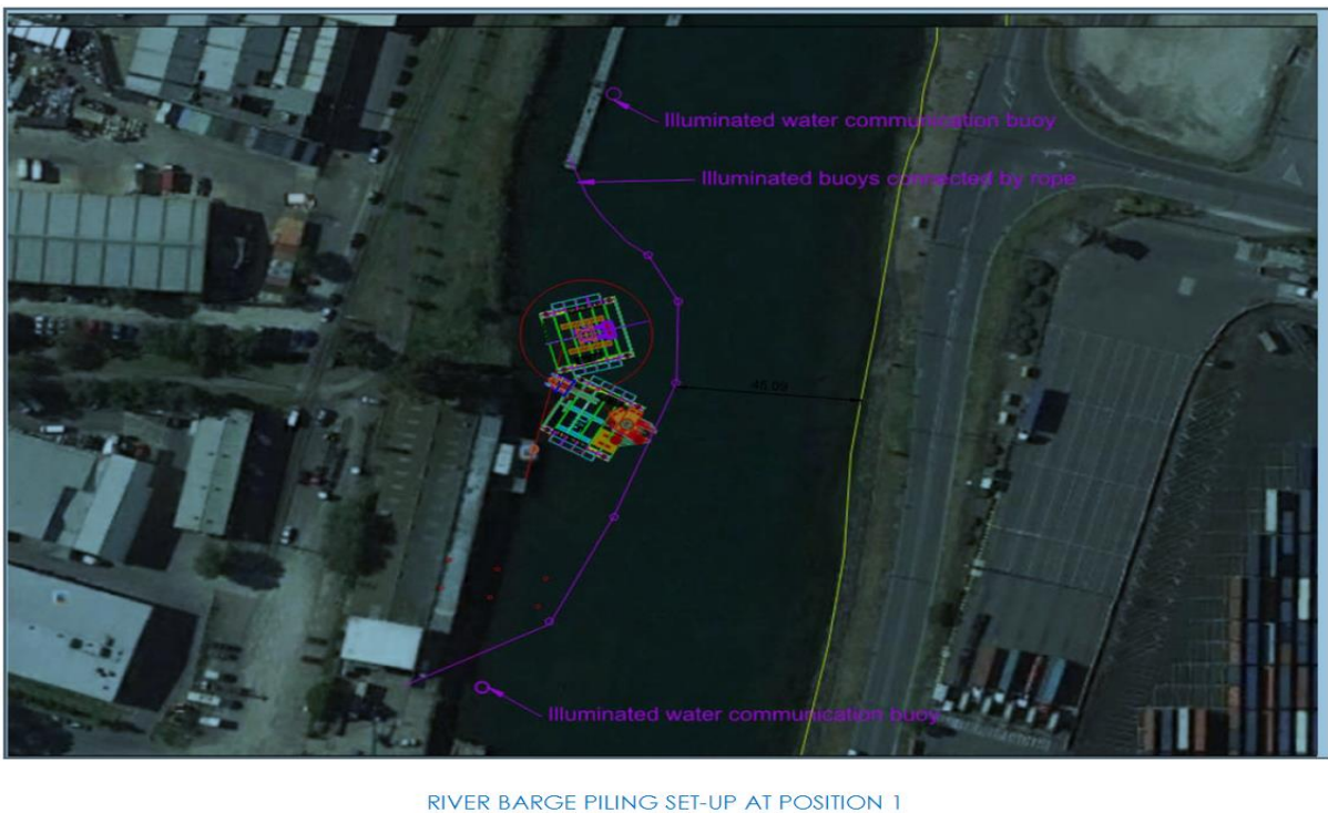
RIVER BARGE PILING SET-UP AT POSITION 1