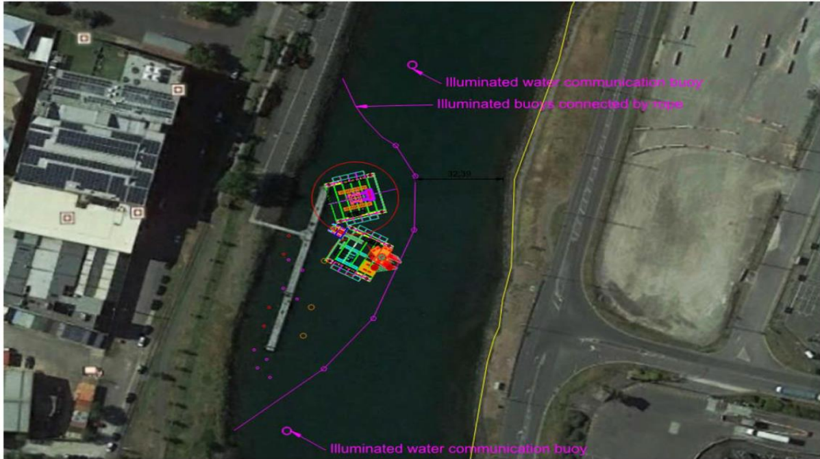
RIVER BARGE PILING SET-UP AT POSITIONS 2 & 3