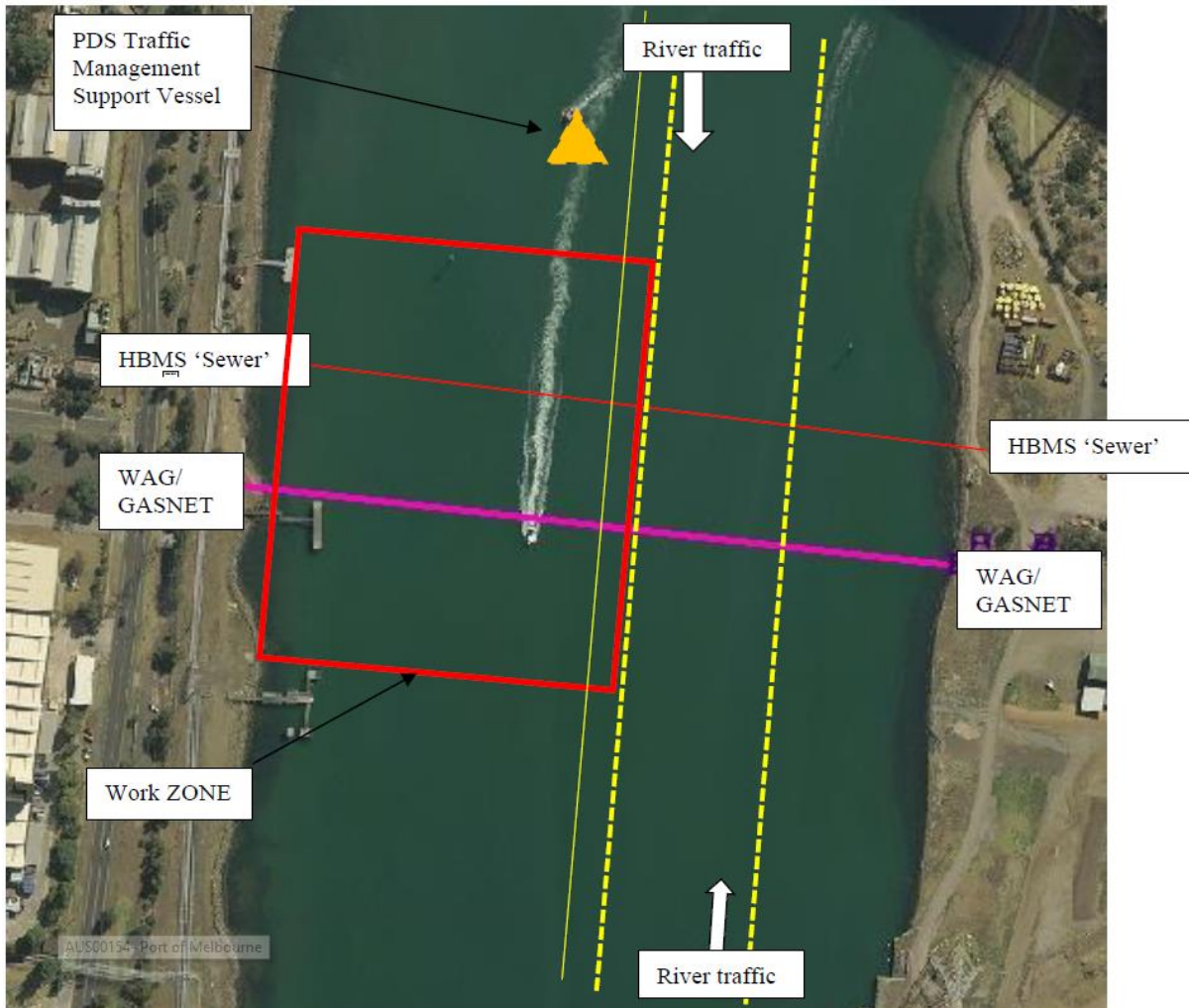
Figure 4. Overview of work zone and general positioning of traffic management vessel – When working WEST of the channel during Closure