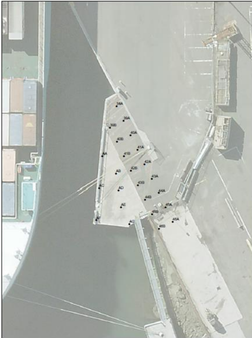
WEBB DOCK 1 EAST – LOCATION OF PILE WORKS

This notice is a direction of the Harbour Master pursuant to section 232 of the Marine Safety Act 2010 (Vic) The requirements of section 232(2) have been taken into account.