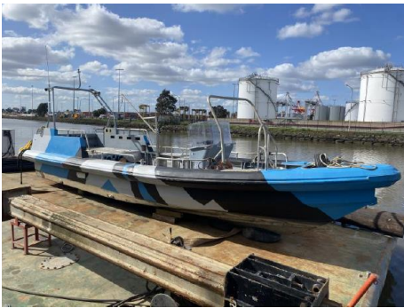
TMC V JETBOAT