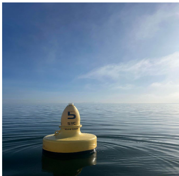
Sandringham Yacht Club Buoy 5

This notice is a direction of the Harbour Master pursuant to section 232 of the Marine Safety Act 2010 (Vic) The requirements of section 232(2) have been taken into account.