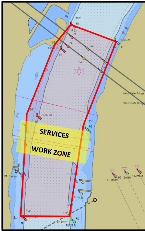
MINIMUM WAKE AND WASH ZONE - FIGURE 1 NOT FOR NAVIGATIONAL USE