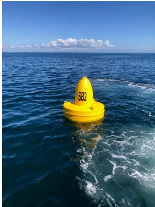
SB1 & SB2 Buoys